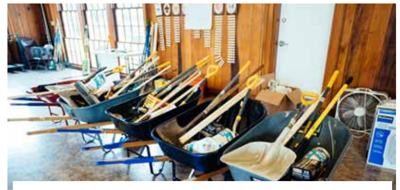
As donations arrived, the Blanton Building housed supplies for mucking teams and became a distribution center.